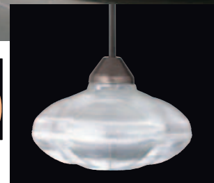
The Quad featuring glass optics Available in type90, 50 and 30 Type30 (20-40% upright) shown here