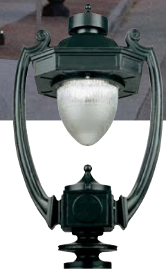
Harp Series featuring glass optics on a Wadsworth ornamental post